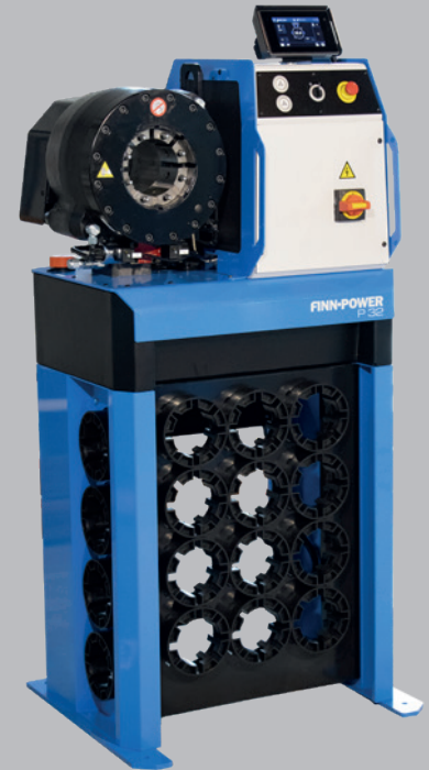
Tool rack with QuickChange-tool as an option.