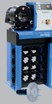
Tool base with QuickChange-tool as an option.