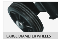
LARGE DIAMETER WHEELS