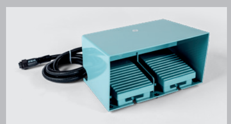
Foot pedal as an option (factory installation only).