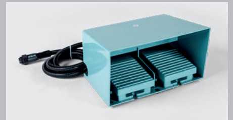
Foot pedal as an option (factory installation only).