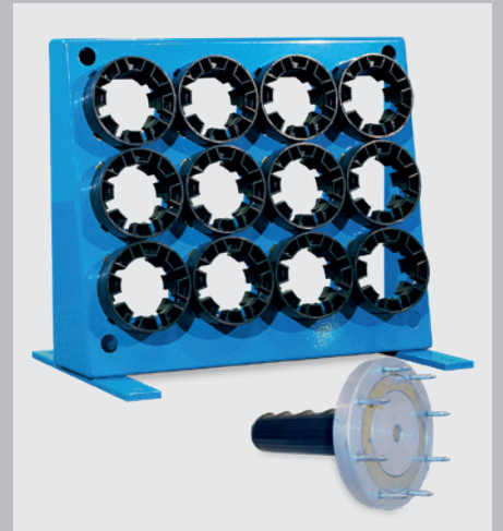
Tool base and Tool rack with QuickChange-tool as an option.