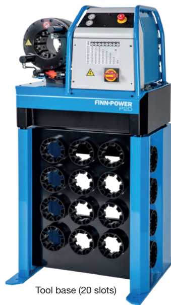
Tool base (20 slots)